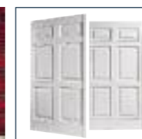
SIDE HINGED SENATOR DOOR SPLIT 1/2:1/2