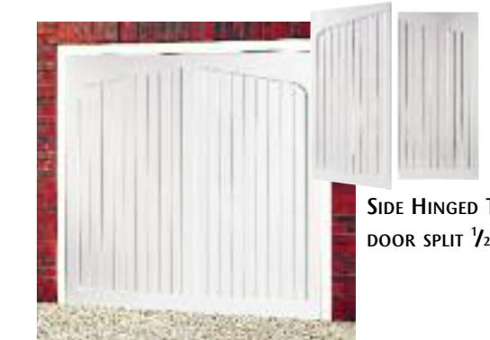
SIDE HINGED TUDOR DOOR SPLIT 1/2:1/2

SINGLE DOOR SIZE, UP & OVER OPENING, SIDE HINGED OPENING