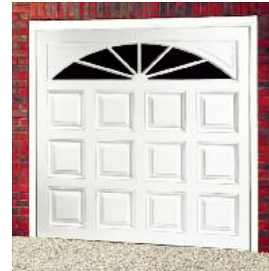
SINGLE & DOUBLE DOOR SIZE, UP & OVER OPENING