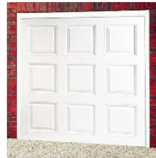
SINGLE & DOUBLE DOOR SIZE, UP & OVER OPENING, SIDE HINGED OPENING