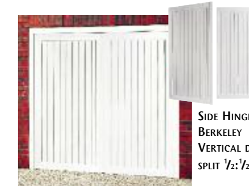
SIDE HINGED BERKELEY VERTICAL DOOR SPLIT 1/2:1/2

SINGLE DOOR SIZE, UP & OVER OPENING, SIDE HINGED OPENING