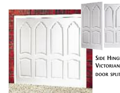
SIDE HINGED VICTORIANA DOOR SPLIT 1/2:1/2