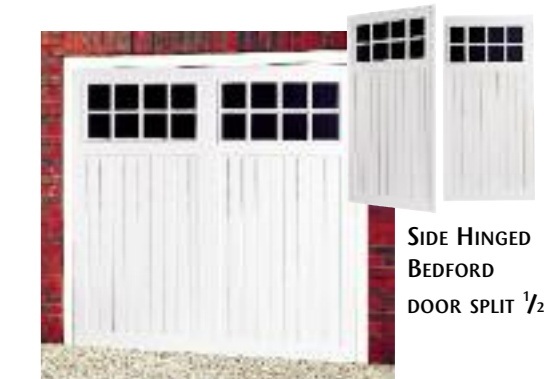
SIDE HINGED BEDFORD DOOR SPLIT 1/2:1/2

SINGLE DOOR SIZE, UP & OVER OPENING, SIDE HINGED OPENING