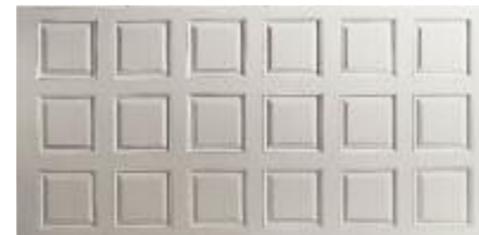
REGAL DOUBLE DOOR