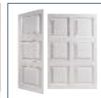
SIDE HINGED REGAL DOOR SPLIT 1/2:1/2