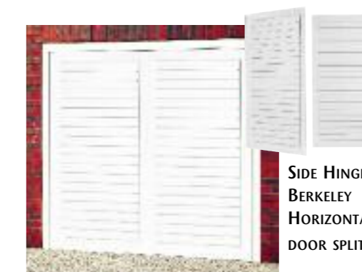
SIDE HINGED BERKELEY HORIZONTAL DOOR SPLIT 1/2:1/2

SINGLE DOOR SIZE, UP & OVER OPENING, SIDE HINGED OPENING