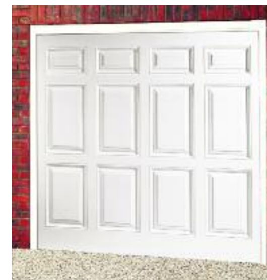
SINGLE & DOUBLE DOOR SIZE, UP & OVER OPENING, SIDE HINGED OPENING