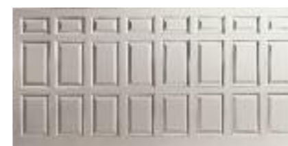
SENATOR DOUBLE DOOR